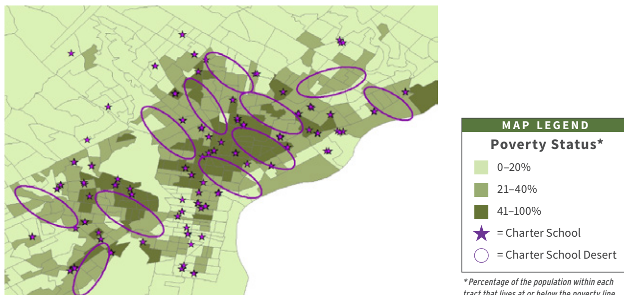
Map 3: Charter school deserts in the Philadelphia metro area