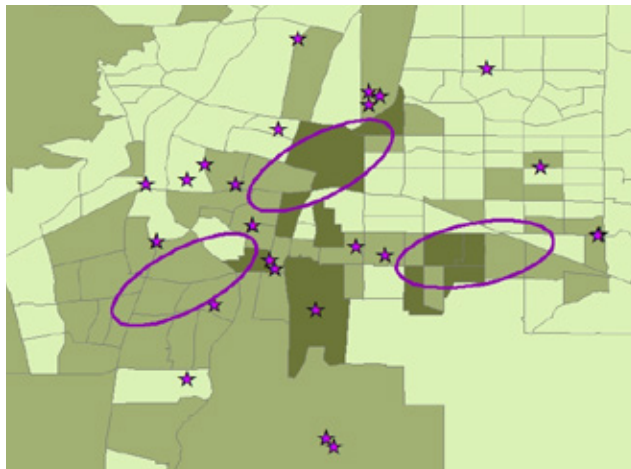
Map 2: Charter school deserts in the Albuquerque metro area

*Percentage of the population within each tract that lives at or below the poverty line.