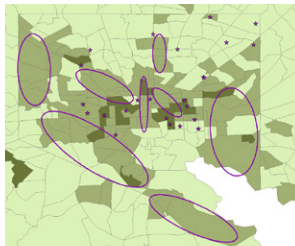
Map 2: Charter school deserts in the Baltimore metro area

Readers should note several points. First, we have not tried to describe, analyze, or infer how state policies may impact the distribution of charter schools in Maryland—simply to show which high-poverty areas lack such schools. Second, although we focus on school locations, location alone is insufficient to ensure that families have viable access to schools. Nearby schools may not be available to families if they’re filled to capacity, if policies prohibit transfer, or if transportation is unavailable. Third, some rural areas may lack charter schools simply because the population is too thin to support them. Fourth, our report does not address school quality, but the companion website allows users to view schools’ math and English language arts proficiency data. Finally, visually identifying charter school deserts is inevitably vulnerable to human error, as they may be identified differently based on how contiguous census tracts are positioned and how “desert circles” are drawn.