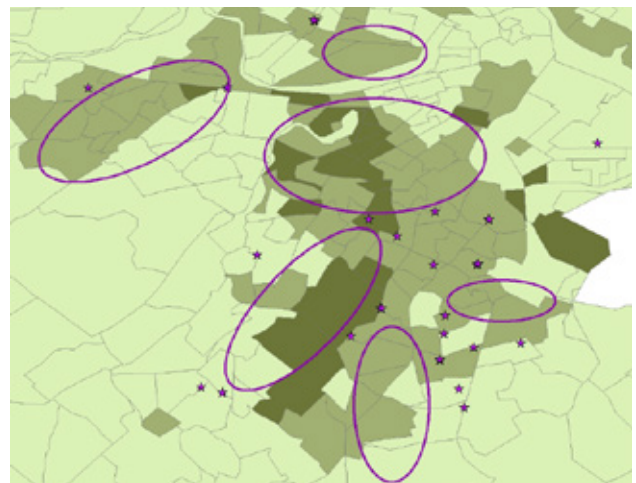
Map 2: Charter school deserts in the Boston metro area

Readers should note several points. First, we have not tried to describe, analyze, or infer how state policies may impact the distribution of charter schools in Massachusetts—simply to show which high-poverty areas lack such schools. Second, although we focus on school locations, location alone is insufficient to ensure that families have viable access to schools. Nearby schools may not be available to families if they’re filled to capacity, if policies prohibit transfer, or if transportation is unavailable. Third, some rural areas may lack charter schools simply because the population is too thin to support them. Fourth, our report does not address school quality, but the companion website allows users to view schools’ math and English language arts proficiency data. Finally, visually identifying charter school deserts is inevitably vulnerable to human error, as they may be identified differently based on how contiguous census tracts are positioned and how “desert circles” are drawn.