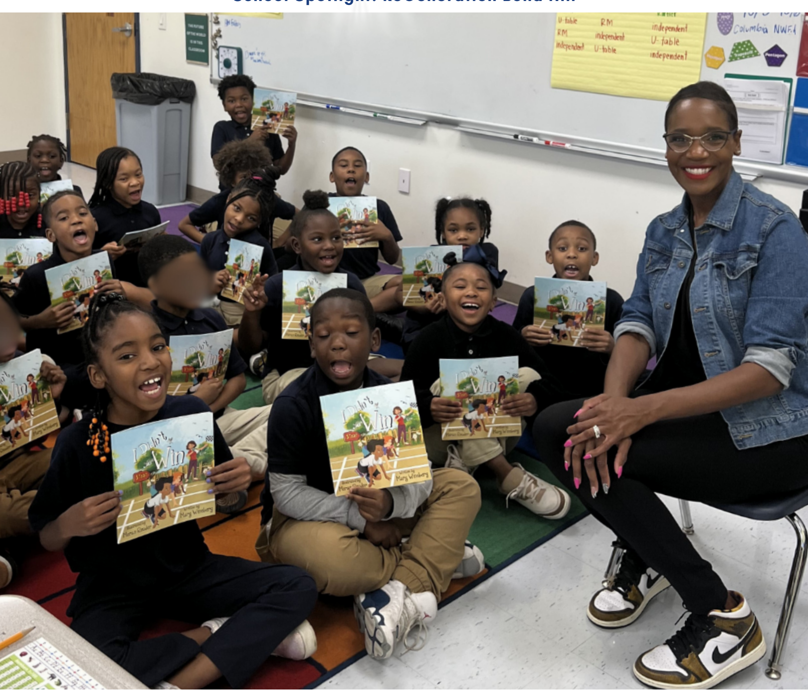
School Spotlight: ReGeneration Bond Hill