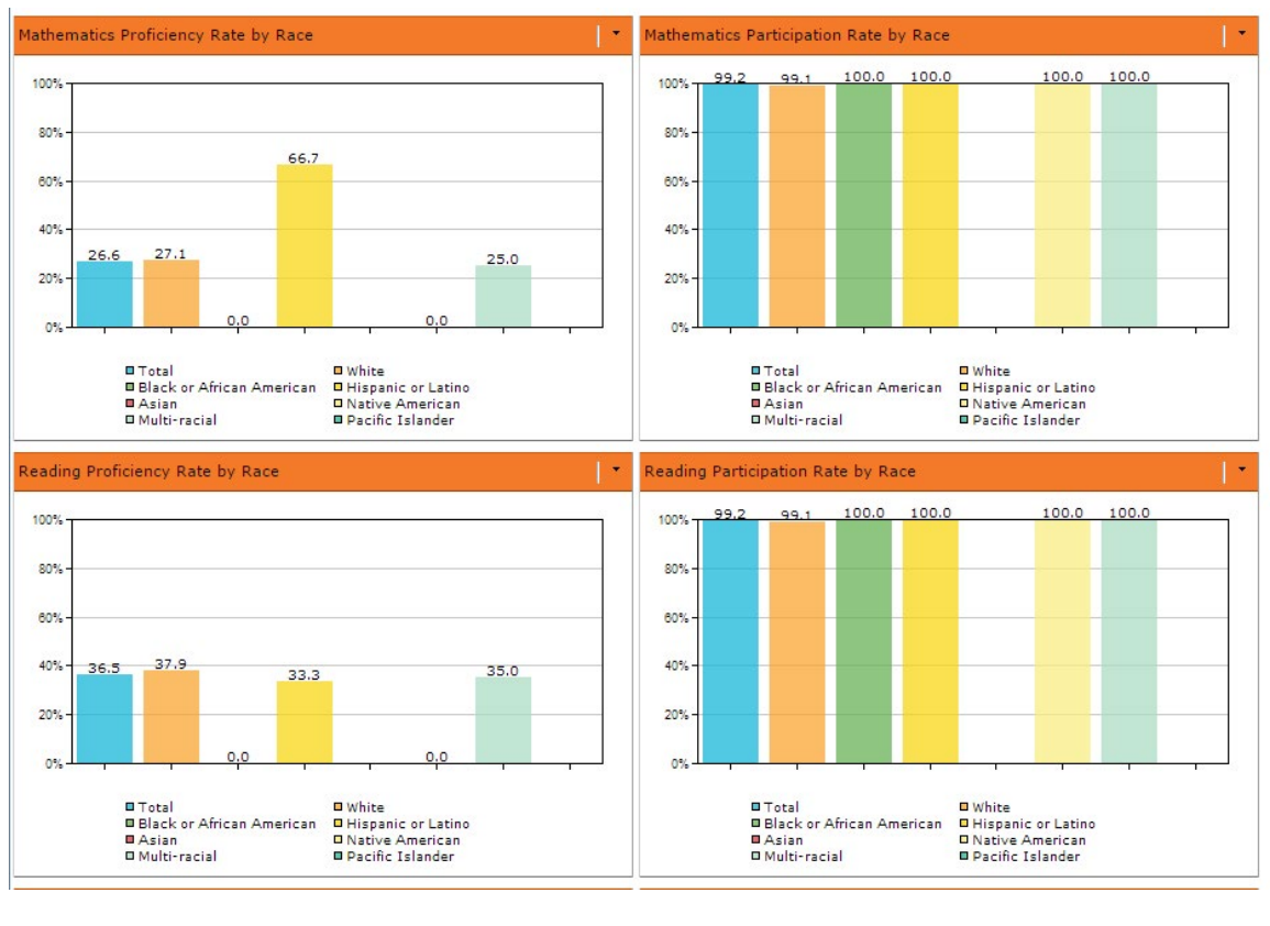
EXHIBIT A <sup>4</sup>